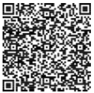
AR / VR